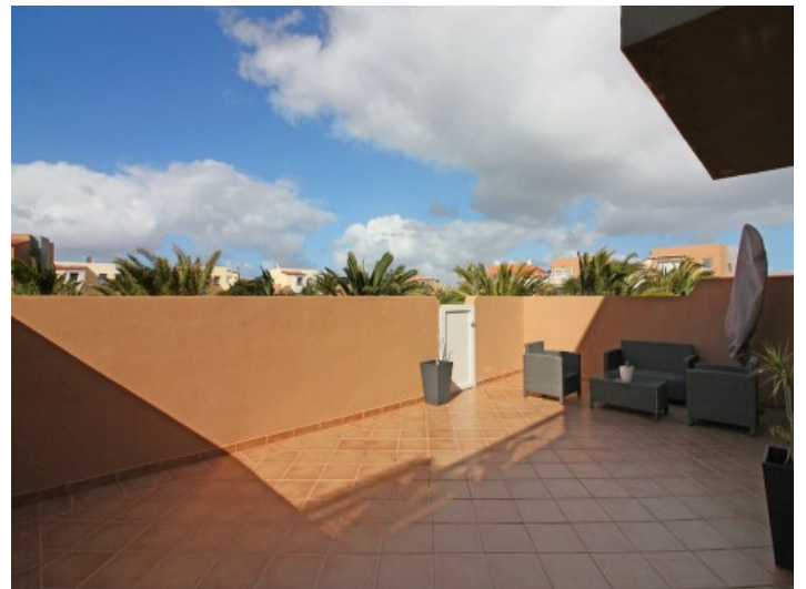
Rooftop terrace with wonderful views