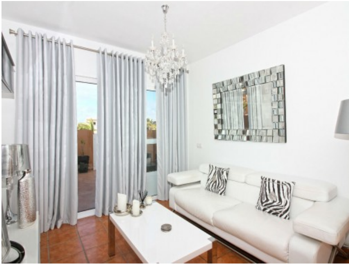
Living room with direct access to the terrace