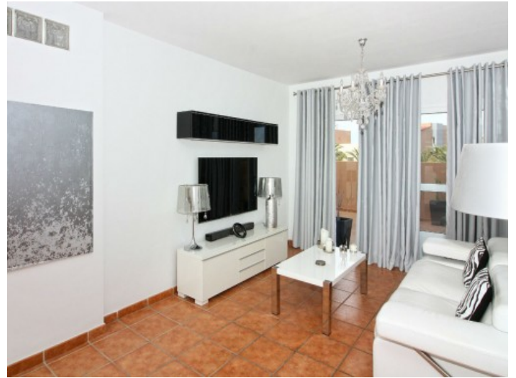
Modern and bright living room