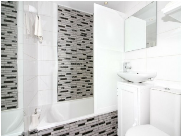
Bright and modern bathroom