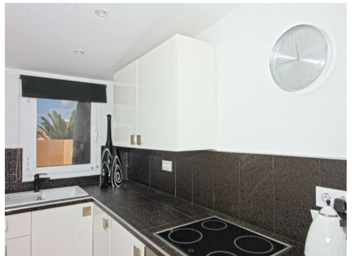
Modern designer kitchen

Toda la información como mejor se puede saber, salvo por error durante el periodo de venta. Sirva este documento como un informe previo, las bases legales solo serán válidas a través de un contrato de compra acordado ante Notario.