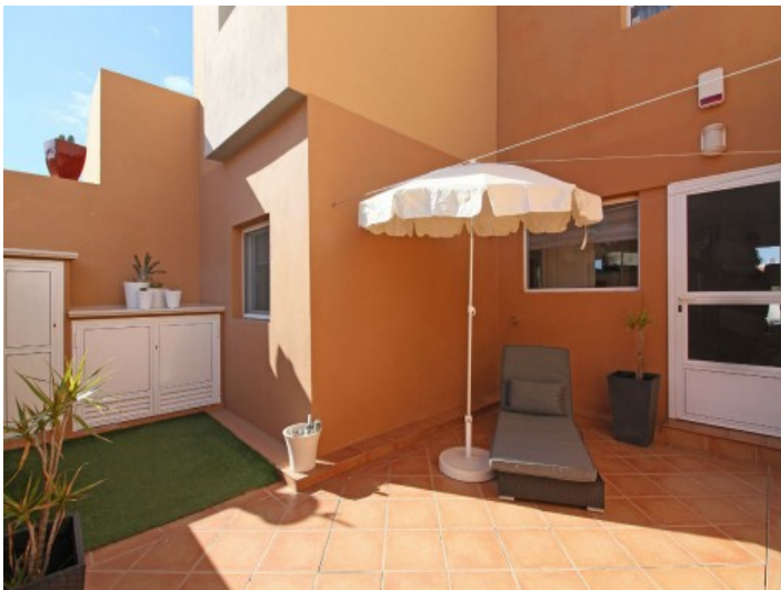
Sunny roof terrace