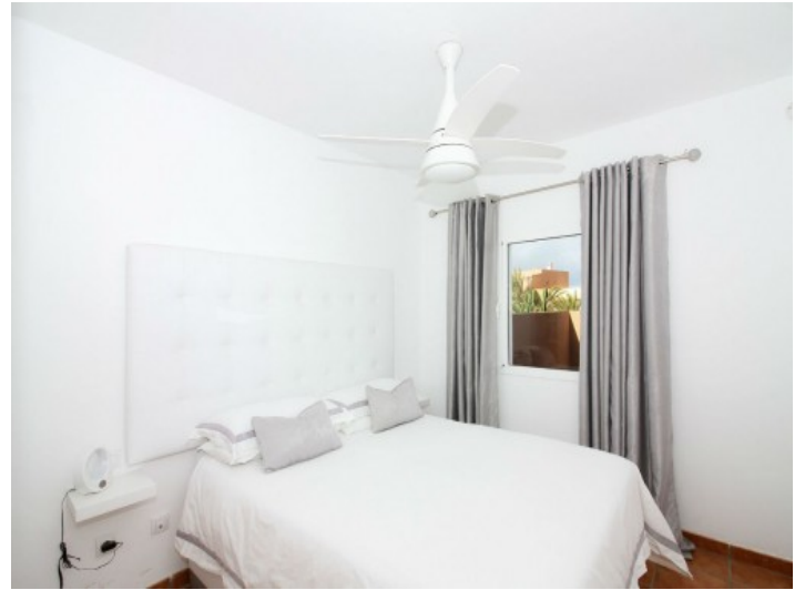
Bedroom with double bed