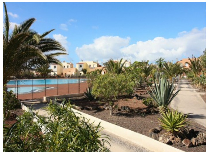
Access to the pool area

Toda la información como mejor se puede saber, salvo por error durante el periodo de venta. Sirva este documento como un informe previo, las bases legales solo serán válidas a través de un contrato de compra acordado ante Notario.