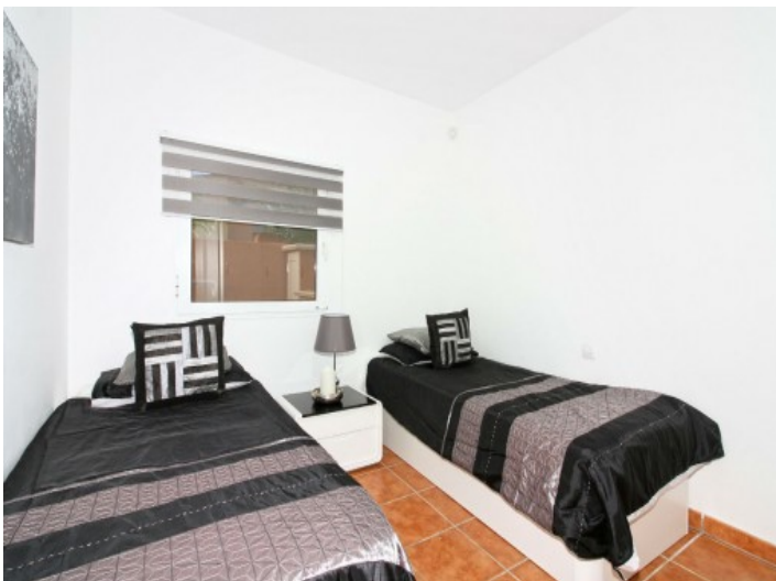
Bedroom with two single beds