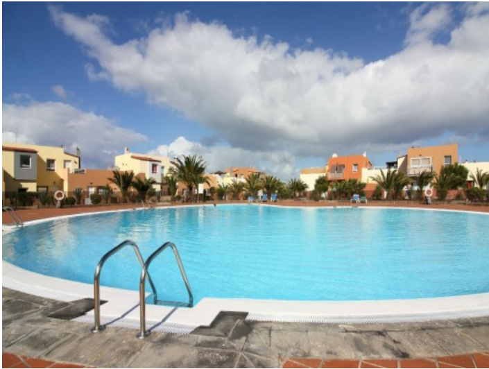
Amazing pool area